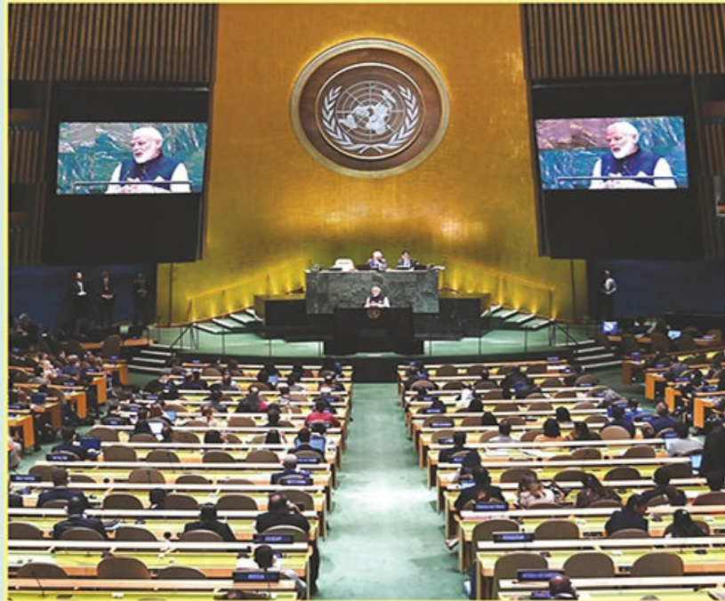
Prime Minister Shri Narendra Modi addressing the 74th session of the United Nations General Assembly (UNGA), in New York, USA on September 27, 2019